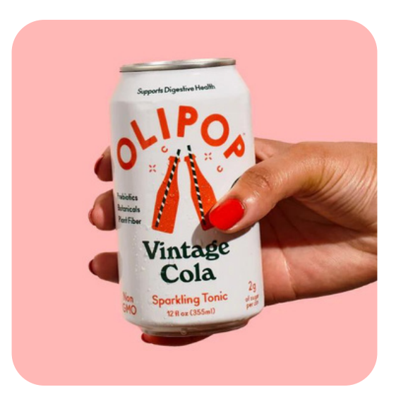
OLIPOP's Vintage Cola