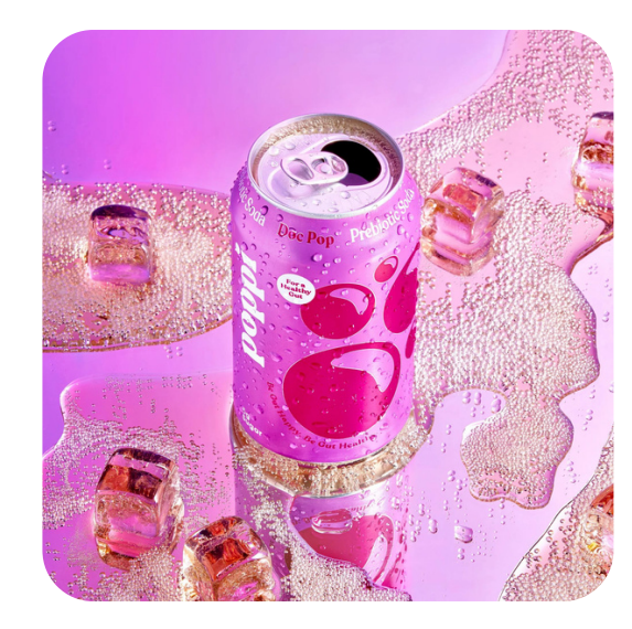
Poppi's Doc Pop

As well as coming out with fun new flavors like ginger lemon, raspberry rose, and tropical punch, both brands have also come out with many of the nostalgic flavors like coca cola, dr. pepper, grape soda, and orange soda. And there is one thing we do know... nostalgia will never go out of style.