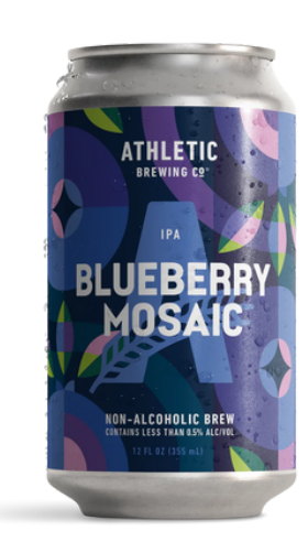
Athletic Brewing NA Blueberry IPA